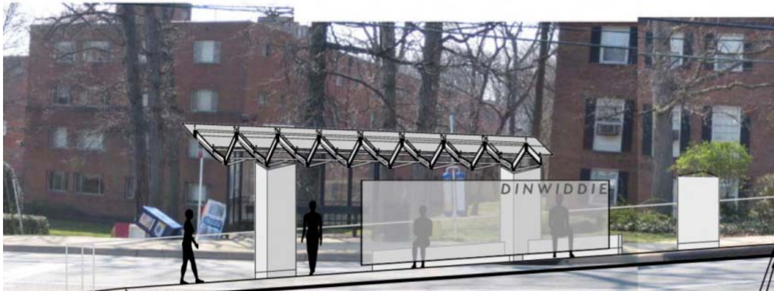
Southwest Corner of South Dinwiddie Street