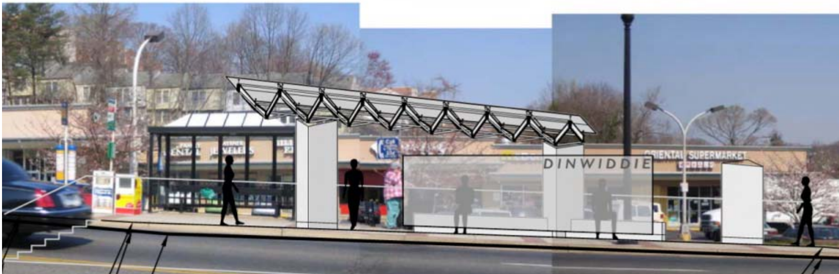
Northwest Corner of South Dinwiddie Street