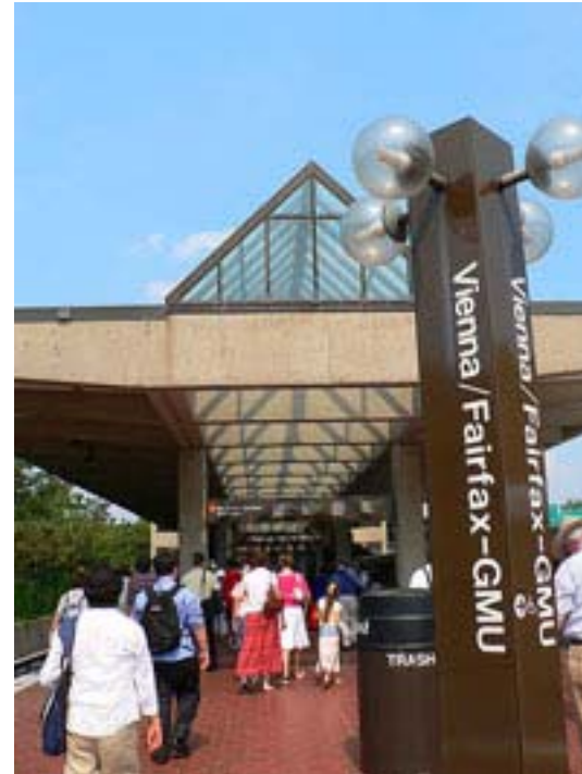
Vienna Metrorail station