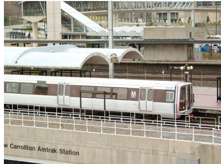
New Carrollton Metrorail station