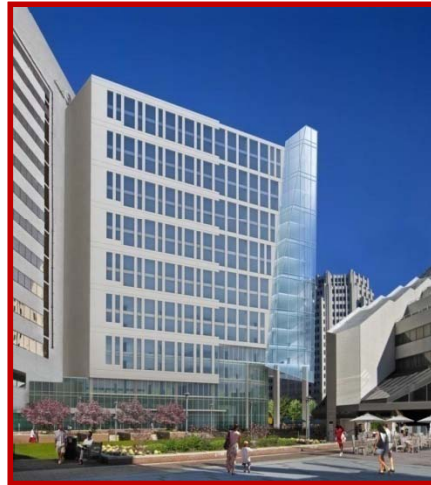
Office Tower Design Concept