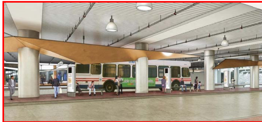
Metrobus Facility Improvements