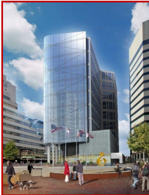
Office Tower Design Concept

Authorize staff to negotiate amendment of Bethesda Station lease to replace three-story food court building with 260 - 280,000 SF office tower